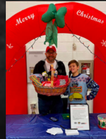
BEECHWOOD SANTA FEST