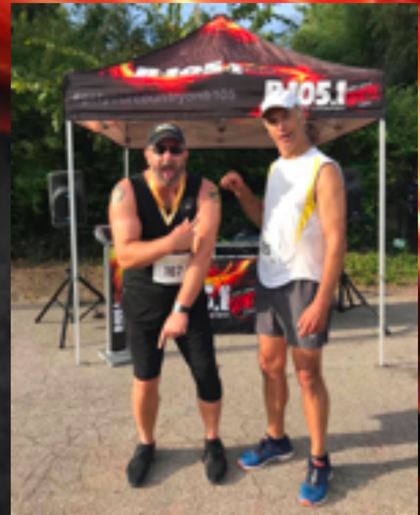
EMCEEING & RUNNING IN THE CINCINNATI ZOO CHEETAH RUN