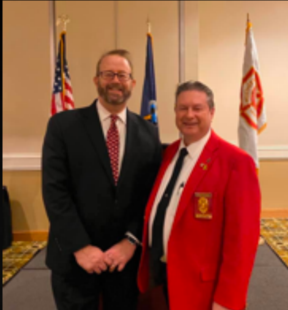
THE NORTHERN KENTUCKY FIREFIGHTERS AWARDS