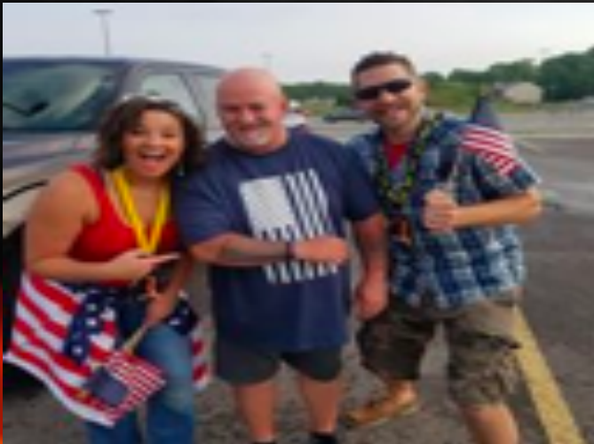
1000 FLAG FRIDAY