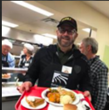
SERVING THANKSGIVING DINNER AT CINCY BEHAVIORAL SERVICES.