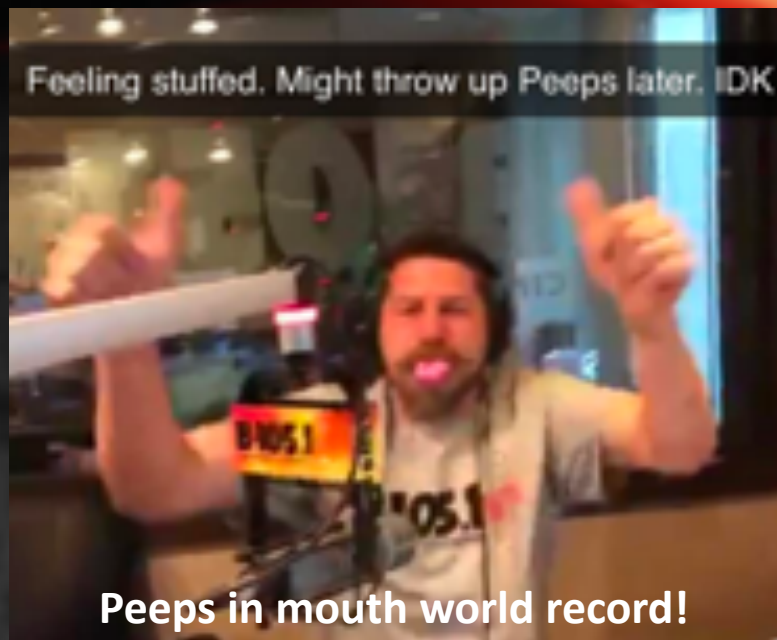
Peeps in mouth world record!