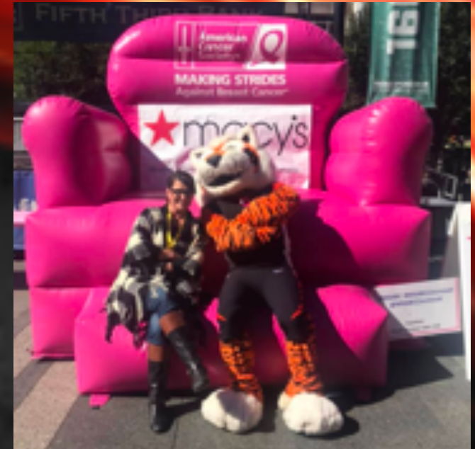
PAINT THE SQUARE PINK