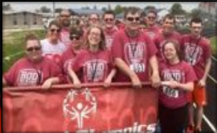
SOUTHEAST INDIANA SPECIAL OLYMPICS