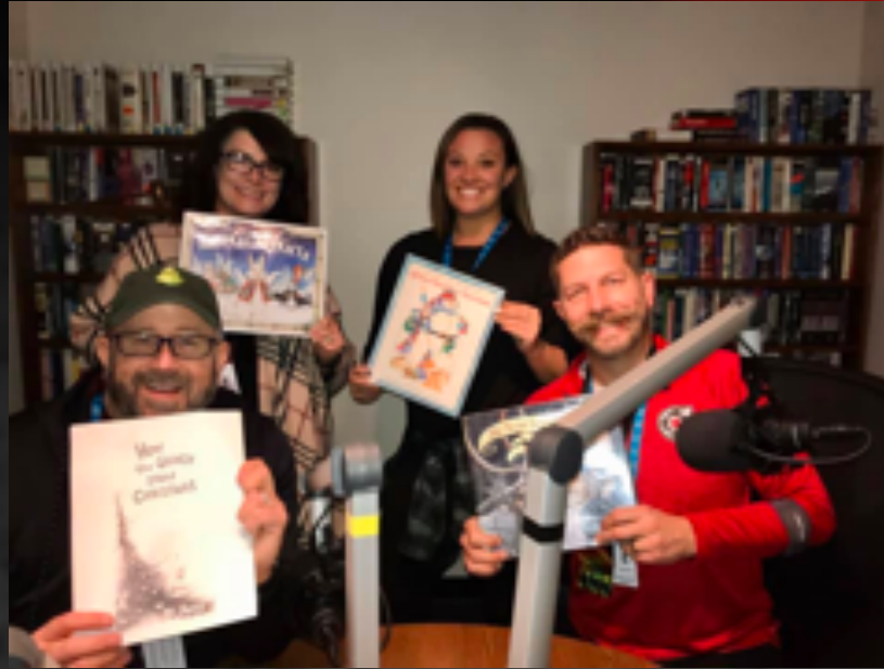
STORIES OF THE SEASON FOR THE CINCINNATI ASSOCIATION OF THE BLIND AND VISUALLY IMPAIRED READING RADIO PROGRAM