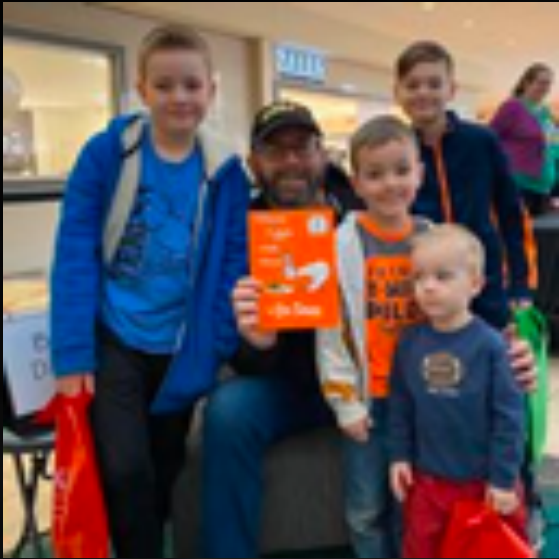
READ ACROSS AMERICA WEEK