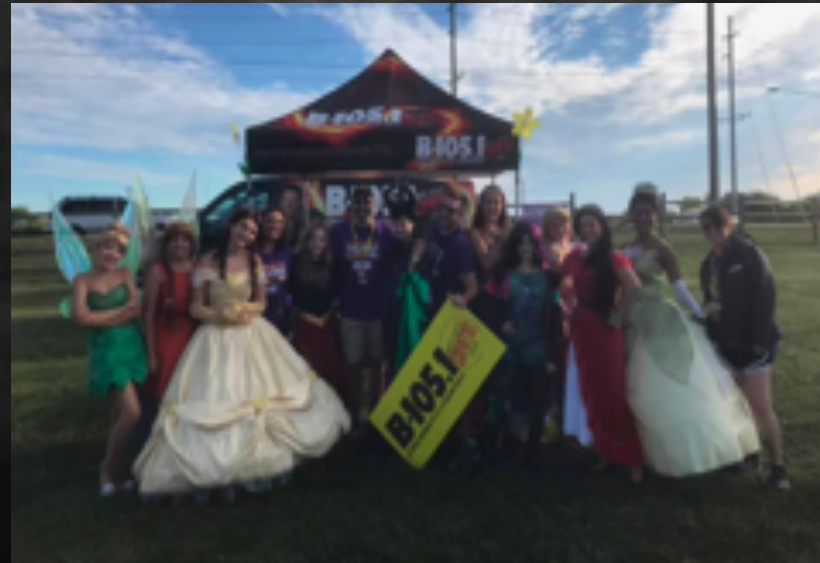
WALK TO END ALZHEIMER'S